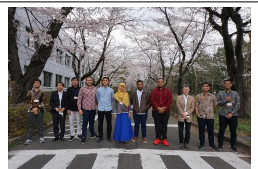
Seismic & Tsunami Course