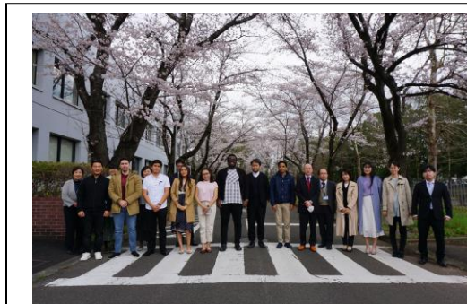
Earthquake Engineering Course