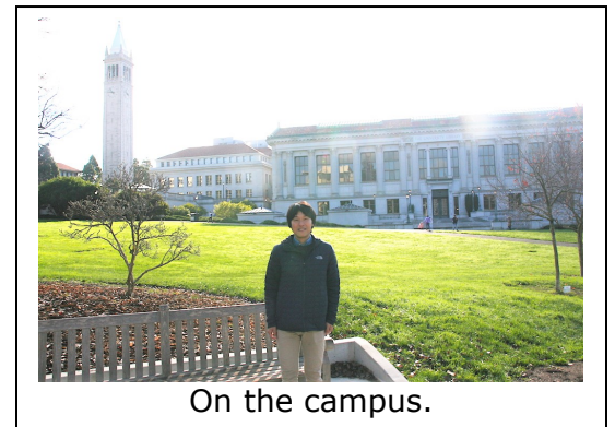
On the campus.

range of seismological topics. During my stay at BSL, I had been conducting research with Prof. Douglas Dreger. We detected non-stationary signals (e.g. volcanic tremors) in seismic ambient noise and investigated the source mechanisms. The results will be submitted for publication in a peer-reviewed journal. The research topic was new and exciting to me, and I could broaden my knowledge. I deepen relationships with lab members and other visiting scholars, and every day was very fulling for me. I also participated in some training courses for visitors; conducting better lectures in a class, and academic and social English. I believe these experiences had improved my skill as a lecturer and would like to make this experience useful for the IISEE training course. California experienced an earthquake sequence (Mw7.1 Ridgecrest earthquake) and wildfires in 2019 and the campus had been affected, but I really had valuable experiences in my life thanks to everyone. I am grateful to have been given the opportunity to stay in Berkeley!