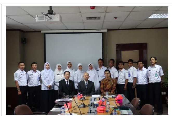
Group photo at BMKG (After the meeting)