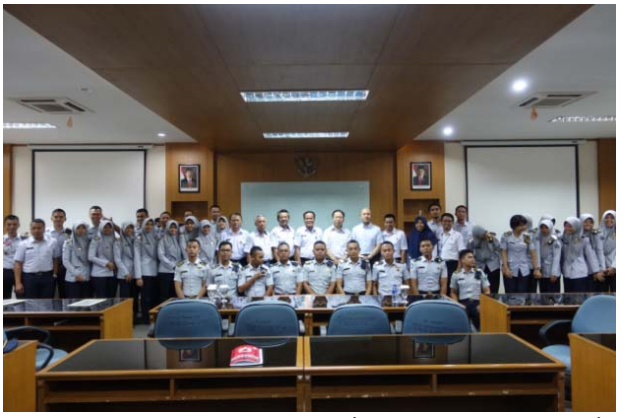
Group Photo at STMKG (After the seminar)